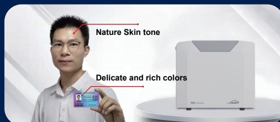
With high definition photo effect which printed by Dye sublimation technology

Dual interface chip card encoding module Contactless ID Card encoding module UHF chip card encoding module Magnetic stripe card encoding module